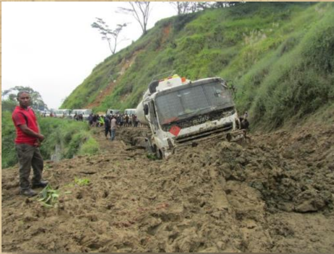
This landslide on the way to the Jonah Translation Workshop (April 2017) delayed us only an hour