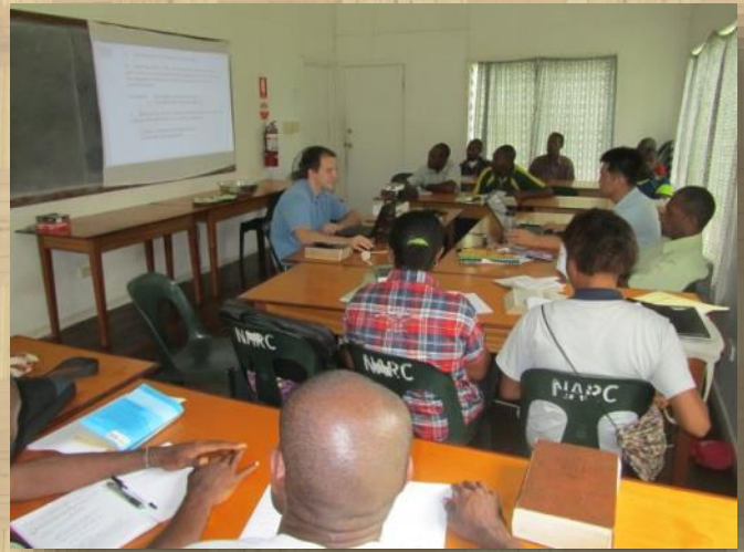
Markham MLP Jonah Translation Workshop, April-May 2017